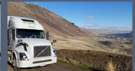
Dmytro Sokolovskyy "HWY 14, Columbia River"